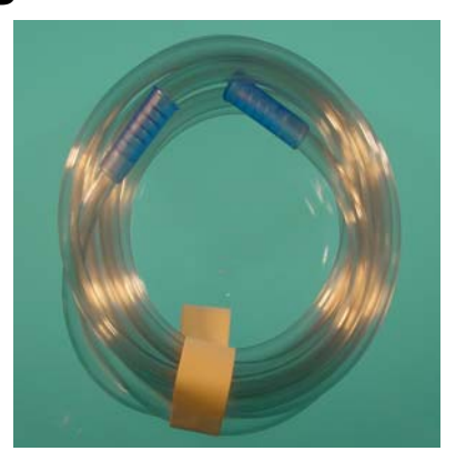
Versatile connection 12 Feet in length Order No. IM- SFRT