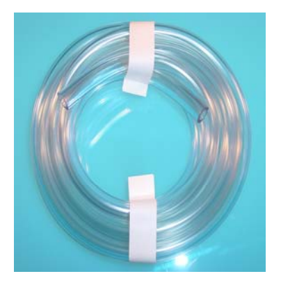
3/8 in. Inside Diameter 10 Feet in length Order No. IM-HFTD