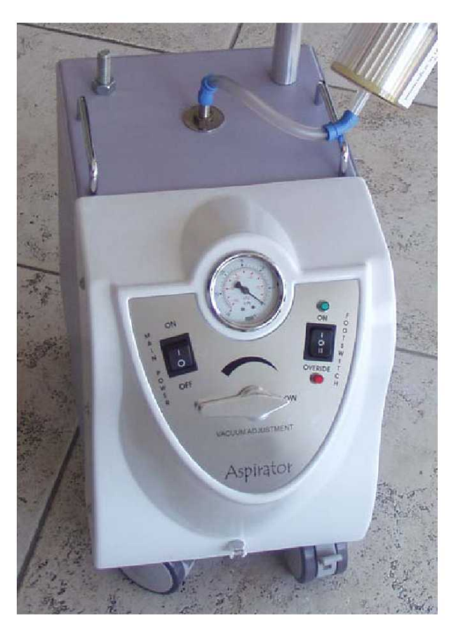
Operating Manual for Model No.

IMI 2: IM-2560-1 (115 V) IM-2560-2 (230 V)